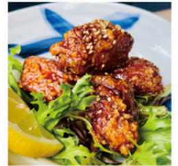
CHICKEN KARAAGE $8