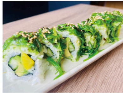
FOREVER GREEN $15