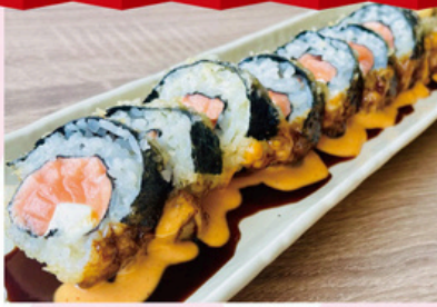
TEMPURA PHILADELPHIA $12