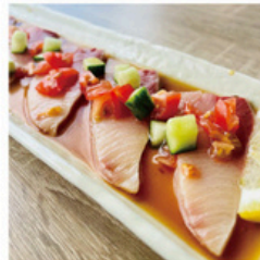
YELLOWTAIL CARPACCIO $17