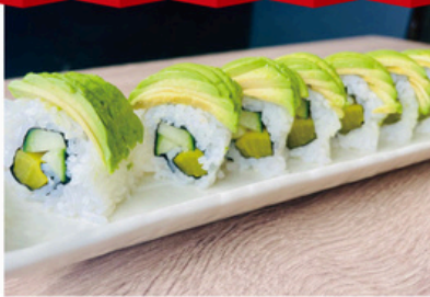
VEGE CATERPILLAR $15