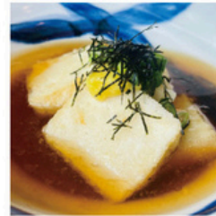
AGEDASHI TOFU $8