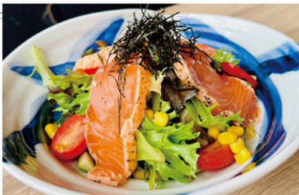
SEARED SALMON SALAD $13